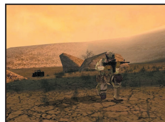
Stealth and careful planning are vital for success in Ghost Recon .

The demo enables you to play Quick Missions on one map. There are three types of single-player game: Mission (accomplish a specific task), FireFight (eliminate the enemy), and Recon (move