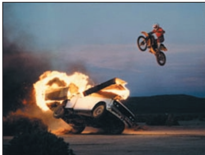
cleaner's workflow makes encoding easy for amateurs and professionals.

> IF YOU USE your Mac to edit digital video, you'll know there is a trade off between image quality and file size. With drag-and-drop encoding, you can compress files from your editing station and output them to a range of formats. discreet cleaner 6 encodes and compresses files for DVD, the Web, video CD and PDAs with results optimised for each platform. cleaner supports a range of file formats: DV, QuickTime with MPEG-4 and Advanced Audio Coding (AAC) support, Video for Windows, (AVI), AIFF/AIFC, AU, WAV, Flash , to name a few. It also supports EventStream, which embeds interactivity into QuickTime, Windows Media and RealSystem files. This includes navigation features like hotspots, chapters, text, keyframes and hyperlinks.