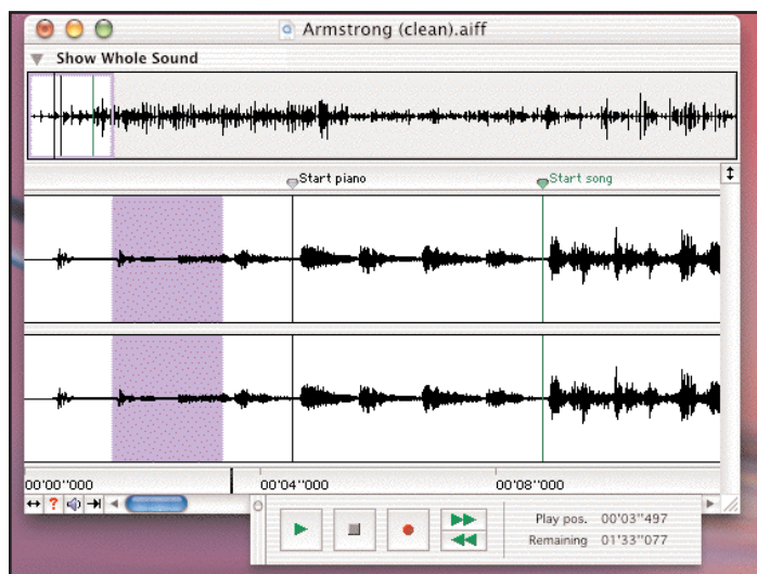
Amadeus is the perfect tool for archiving your old vinyl albums.

> AMADEUS II IS a powerful sound editor for the Macintosh. It runs on Mac OS 8.6 and up and natively on Mac OS X. In addition to the functions you would expect from a sound editor, Amadeus II has four features that distinguish it from other similar products. Amadeus II supports the MP3 and Ogg Vorbis codecs that enable you to achieve very low file sizes, while preserving most of the original quality of your sounds. It's also an ideal tool for transferring your vinyl collection to your