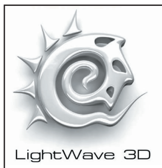
Lightwave is widely used for 3D animation in films and on television.

> THIS FREE TRIAL version of NewTek's 3D package enables anyone with an interest in 3D graphics and animation to test drive an industry standard application. Proven for years in television, film, and games, LightWave 3D is also being used to create graphics for print, Web, industrial design, architecture, medical imaging, and anywhere else a 3D package is needed. LightWave 3D is a true, real-time subdivision surface modeller. With a range of tools such as extrude, bevel, smooth shift, lathe, drag, magnet, and more, modelling is becoming a more tactile experience. In addition, LightWave offers spline modelling, sketch tools, booleans, unlimited layers, use of background images for reference, and import of EPS and other file types.