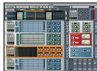
Arturia Storm can work as VST plug-in or as a standalone application.

> STORM MUSIC STUDIO is a music creation application that emulates the environment of a real recording studio: synthesisers, drum machines, sample players, effects, mixing desk, sequencer.